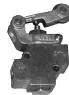
CP3 Cam Poppet Valve