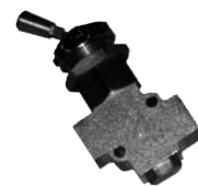
LPP3 Lever Poppet Valve