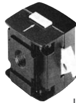
Safety Lockout Valve