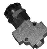
BPP3 Button Poppet Valve