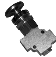
FPP3 Foot/Palm Poppet Valve