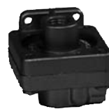
Quick Exhaust Valves