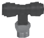
Swivel Tee Centre-Leg